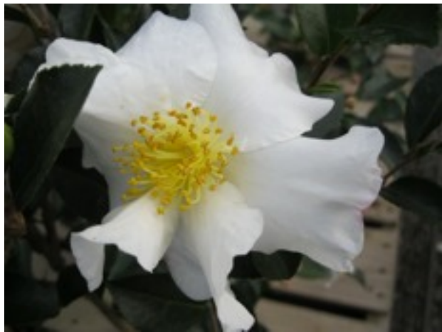
C. sasanqua , “Setsugekka”

An excellent choice for a colorful hedge or screen, espalier, and border shrub is C. sasanqua ‘Setsugekka’ displaying large, perfectly formed semi-double white flowers with ruffled edges and a bright cluster of golden stamens at the center. Flower time is October to early December with moderate upright growth to 8 to 10 feet tall and wide.