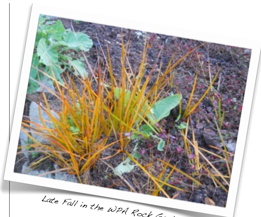
Late Fall in the WPA Rock Garden