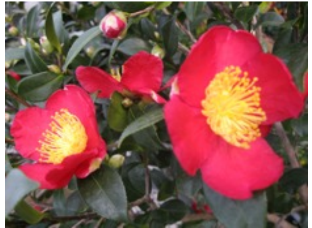
C. sasanqua, “Yuletide”

C. sasanqua ‘Yuletide’ is an example of upright growth. This is one of the only true reds found among the fall blooming camellias, and the plant has a wonderful compact form with small dark green leaves. ‘Yuletide’ looks good in containers or planters, especially when blooming, but can be used in the garden as a border plant or even a hedge plant. Slow growth 8 to 10 feet tall and wide. Flower time is December into January.