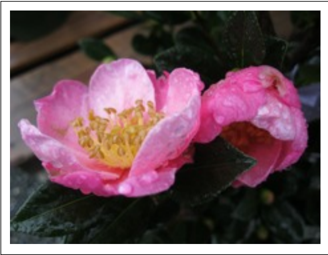
C. sasanqua, “Pink-A-Boo”

My wife purchased another Camellia. By my count, this is her 23rd Camellia sasanqua in her collection. This one is an exceptional pink-flowering sport of the Camellia sasanqua ‘Yuletide.’ Unique not just in color, the blooms of ‘Pink-A-Boo’ are larger and showier, having seven petals rather than five, and boast a remarkable, sweet fragrance. This Camellia was introduced by Monrovia in 2011.