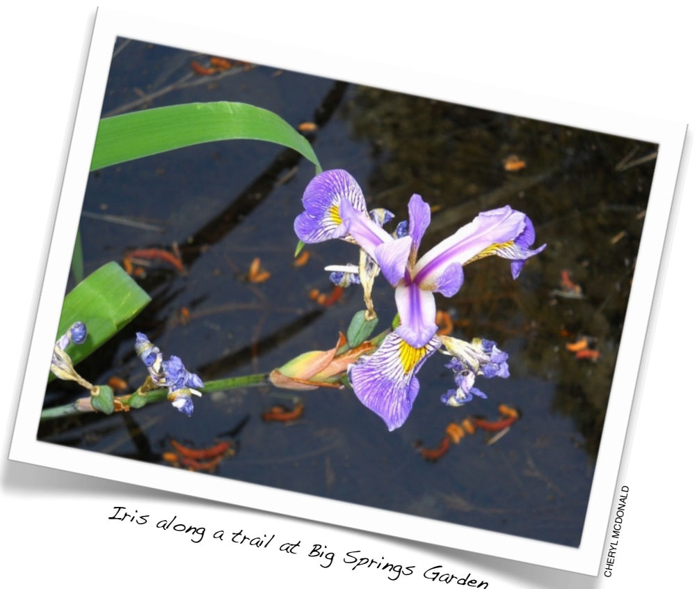
Iris along a trail at Big Springs Garden